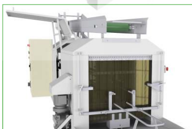
Protecting inlet PVC curtains