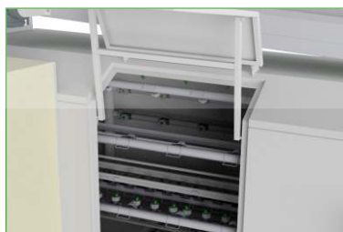
Acid-resistant steel washing jets